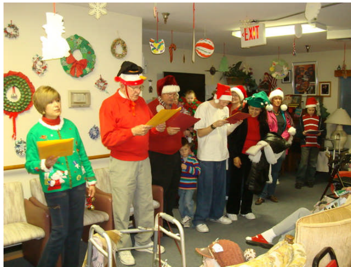
St. Paul's carolers

On December 10th, members of St. Paul's in Henderson, Nevada, caravanned to the north east end of the valley, dressed in Christmas garb and Santa hats. We were headed for the Gaye Haven Nursing Home where 20 residents reside and were eagerly awaiting our visit and a joyful time of singing Christmas Carols.