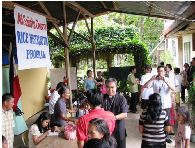
Bp. Raymundo Abogatal at Cathedral of Christ the Redeemer

In poorer parts of the Philippines, rice is a main diet staple. Unfortunately, in 2008, the price of rice has doubled in Asia. Termed the "Asian rice crisis," a combination of lack of farming, rising global oil prices, and weather issues including a draught in Australia created a shortage and price increase.